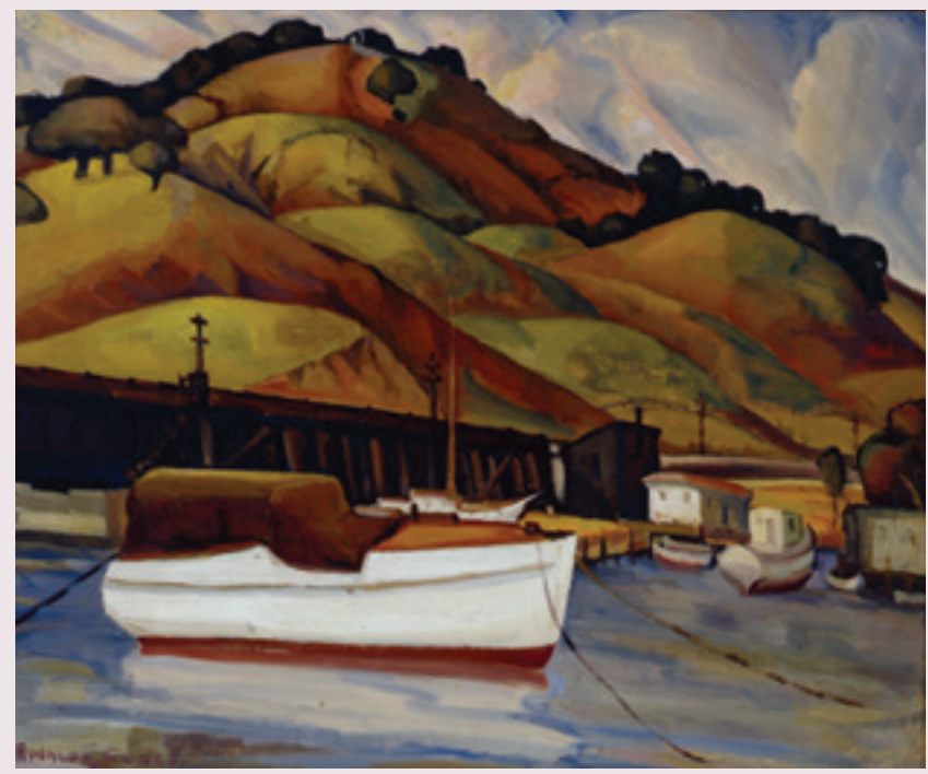
OPPOSITE PAGE: Rinaldo Cuneo , Urban Park , c.1920. Oil on canvas, 23" x 20", Collection of the Museo ItaloAmericano